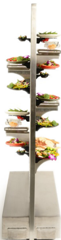
GRANDSTAND SIDE VIEW