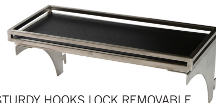
STURDY HOOKS LOCK REMOVABLE SHELF INTO PLACE